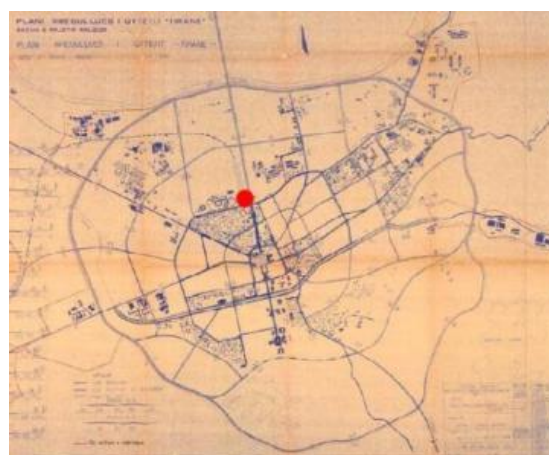
Figure 10. Proposed location of a large multimodal intercity bus station.

create a multimodal node in the city, easily accessible by foot and urban public transport. A large lot is already available for this purpose near the rail station.