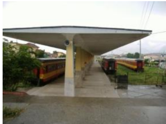
Figure 14. Existing train station.