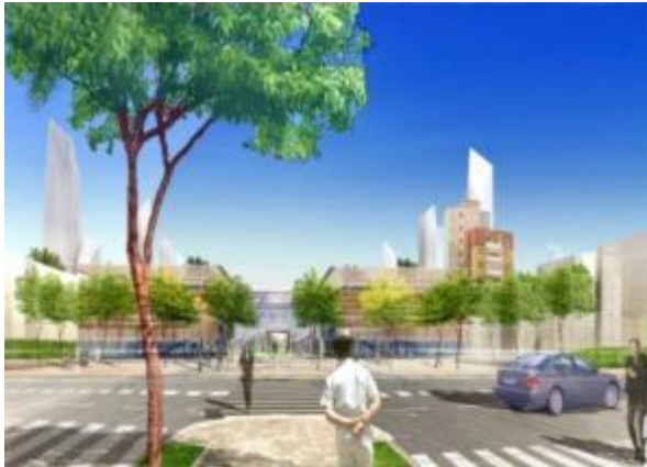
Figure 15. Train station remodel proposed in 2003 by French Architecture Studio.