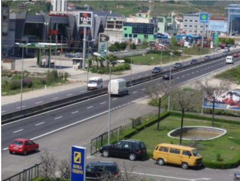
Figure 6. View of big-box businesses along the Tirana-Durrës highway.

speeds. Lower speed limits are posted on sections of the highway to cater for inappropriate junction designs (for example, at grade junctions where grade separation should be used, such as at the Directory of Customs roundabout), and for the fact that the highway crosses residential areas (Landell Mills and Buro Happold 2007).