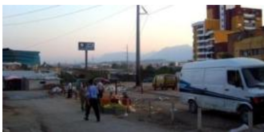
Figure 8. Minivan station near the rail station.

A main issue related to intercity transport is the location of the terminal station, which has changed several times in the past two decades. Presently, some intercity vans are stationed in proximity of the train station (Fig. 6); their informal presence deteriorates the train station area and creates congestion. Another station for intercity buses is located at "Parku i Autobuzëve"; this location is easily accessible but the station area is not well designed (Fig. 7).