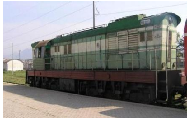
Figure 13. Old train engines from Czechoslovakia, still in use by the Albanian railroad.

The station's location has long been a matter of debate among professionals. Proposals to move it farther from the center, in order to relieve congestion, have so far been dismissed as too expensive. In 2003, a revitalization plan was approved for the center, designed by French Architecture Studio, which envisioned the transformation of the existing dilapidated station into a high tech building (Fig. 13). This plan has not been implemented yet and the City is currently considering other proposals.