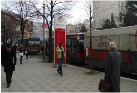
Figure 11. The numerous and large shuttles that serve suburban businesses do not have a proper station in the center and exacerbate inner-city congestion.