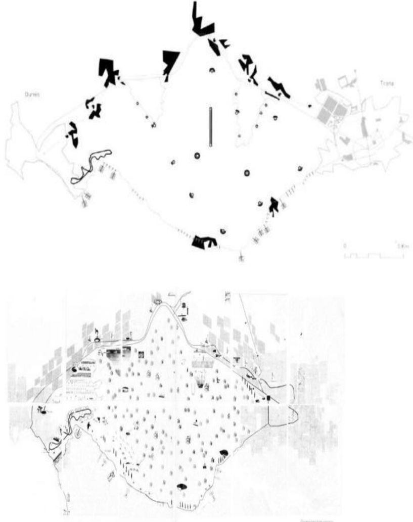
Figure 3. Mid- and long- term development in "Durana". Green areas and recreational activities would be accommodated between the northern and the southern corridors that connect Tirana and Durrës.

2002). This has facilitated sprawl as permitting requirements are lax outside the City of Tirana administrative borders. Some urban planners are now talking about the eventual fusion of Tirana and Durrës into a new metropolis called "Durana" (Fig. 1; see Dharmo 2007, Declerck 2004).