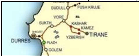
Figure 12. Rail network in the Tirana-Durrës region.

Albania has a small, domestic rail network, which comprises 447 km of main lines and 230 km of secondary lines. The construction of the current passenger network started in 1947 and came to an end in 1987. Most of the rail tracks run through the western, flat part of the country. 1 Durrës rather than Tirana is the country's main rail hub (Fig. 60).