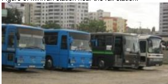
Figure 9. Intercity bus station in the inner city.

An large study by the Politecnico di Bari (2008) on the location of the intercity bus station, which took into consideration accessibility, economic, and land use issues, and the new regulatory plan of Tirana, proposed that the new station be near the rail station (Fig. 8). This would