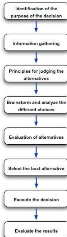
Fig. 2. Steps of decision making process

Research phase of the decision-making process includes activities identifying problems associated with reviewing the circumstances of the conditions for making decisions. Analysis and placement cannot be identified until the